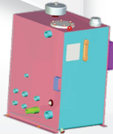
Current State 40 Gallon Hydraulic Tank